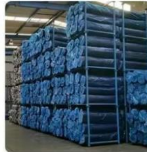
fabric roll storage